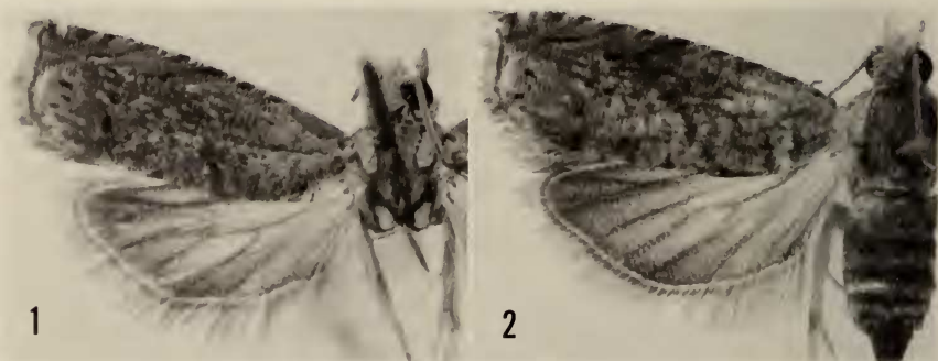
FIGS. 1-2. Cydia largo Heppner, new species, Florida (paratypes): 1, ♂; 2, ♀.

Abdomen. Fuscous; venter buff-white. Male genitalia: tegumen a simple band; un-